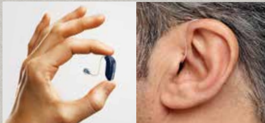
Compact size, elegant colors and Speaker-in-the-Ear design make Oticon Opn™ highly inconspicuous when worn.